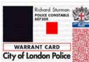
City of London Police warrant card