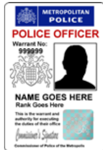
Metropolitan Police Warrant card