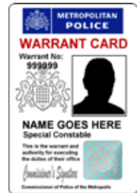
Metropolitan Police Special Constable